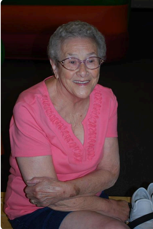
She was one of a kind